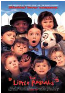
September 1st The Little Rascals