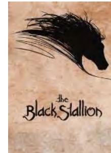
September 15th The Black Stallion