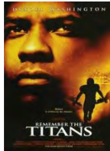
September 8th Remember The Titans