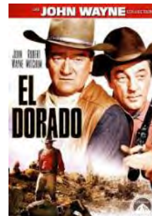
September 29 El Dorado